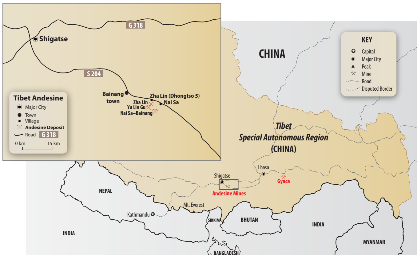
Figure 2. Map of Tibet showing the location of the Nai Sa-Bainang/Zha Lin/Yu Lin Gu andesine mines southeast of Shigatse, along with the Gyaca locality visited by Adolf Peretti in 2009. Map: R.W. Hughes; inset map after Abduriyim et al., 2011