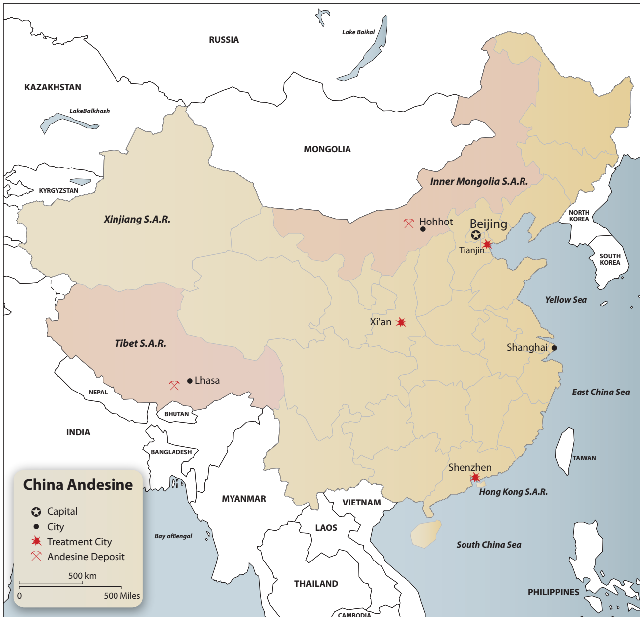
Figure 1. Map of China showing the location of the andesine mines in Tibet and Inner Mongolia, along with the locations of the major treatment centers. Map: R.W. Hughes