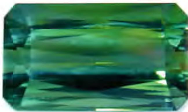
A natural Nigerian tourmaline weighing 16.72 carats. This tourmaline could be mistaken as synthetic based on Raman readings as described in this article.